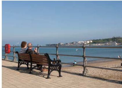
Above Traditional English seaside resort of Swanage, see p60

Dorset is one of England's comeliest counties, renowned for its soft, undulating hills and cliff-backed coastline. There are few conurbations to blot the landscape, instead gentle sheep-speckled slopes and mellow green prospects soothe the traveller's eye. The past looms large here, from the fossil-rich Jurassic Coast to Ancient British sites, and from Roman remains to medieval monuments. Literary types know the region for its associations with Thomas Hardy and his works, in which it appears as "Wessex", while Hardy's own town of Dorchester ("Casterbridge") offers plenty of entertainment for children and adults alike.