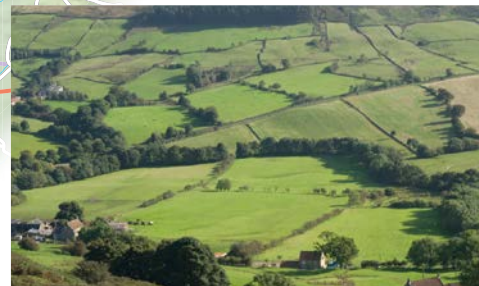
Below The glorious view from the Chimney Bank, on the road to Rosedale, see p190