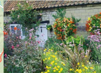
Above Pretty Old Malton, on the road from Castle Howard to Pickering, see p189