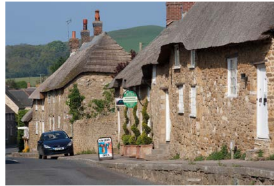
Above The peaceful country village of Abbotsbury, see p61