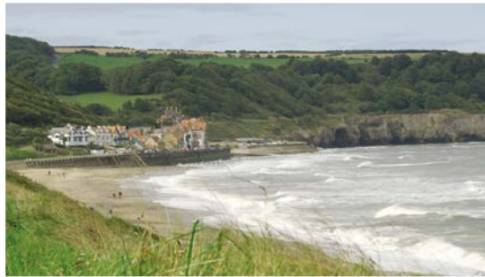
Above Sandsend, just north of Whitby, a small town with a long sandy beach, see p197

England's largest county, North Yorkshire is strewn with picturesque villages, old market towns, stately homes and castles, historic churches, romantic ruins, and so much more. Its coastline is variously quaint, bustling and unspoilt. Its high, heather-clad moorland is stirringly beautiful with great vistas where sheep graze peacefully. There are some purely scenic stretches of dramatic road. This drive, which passes through the Howardian Hills and the centre of the North York Moors National Park, before reaching the seaside, provides more than a glimpse of all these aspects. The trip takes the historic city of York for its point of departure, with a walk at the heart of this wonderful city.