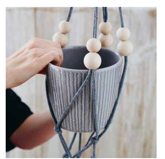
Finally, fit your decorative pot sleeve securely into the hanger, then gently place your choice of plant inside the pot.