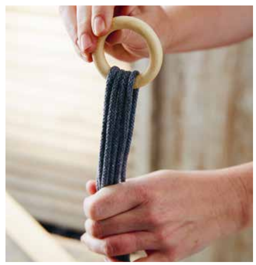
1 Cut 4 lengths of cotton cord measuring 220cm (71/4ft), and 2 lengths measuring 50cm (20in). Thread the 4 long cords through the wooden ring, folding them in half over the edge. Hold the cords together in one hand just below the ring, leaving the lengths trailing below.