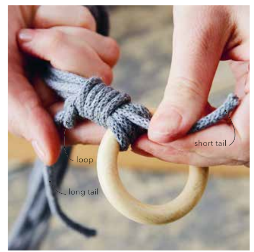
4 Pull the short tail so that the loop slides inside the 5 turns. Cut off both ends close to the binding and tuck inside to complete the knot. This technique is known as a "wrapping knot".