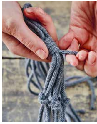
7 Gather all the cords about 6cm (2in) below these knots. Using the second short length of cord, tie them together in another wrapping knot (see steps 2-4). Ensure this knot is as tight as possible, then trim any excess cord to the desired length.