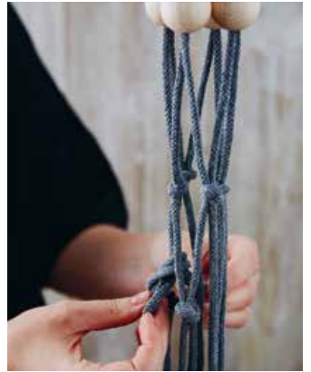
Take 1 cord from 2 adjacent pairs and tie them together in a knot about 8cm (3in) down from the beads. Repeat this 3 times until all the cords are tied together. Repeat this process about 6cm (2in) below these knots (again taking 2 cords from adjacent pairs) to make another set of knots. The cords should now resemble a net.