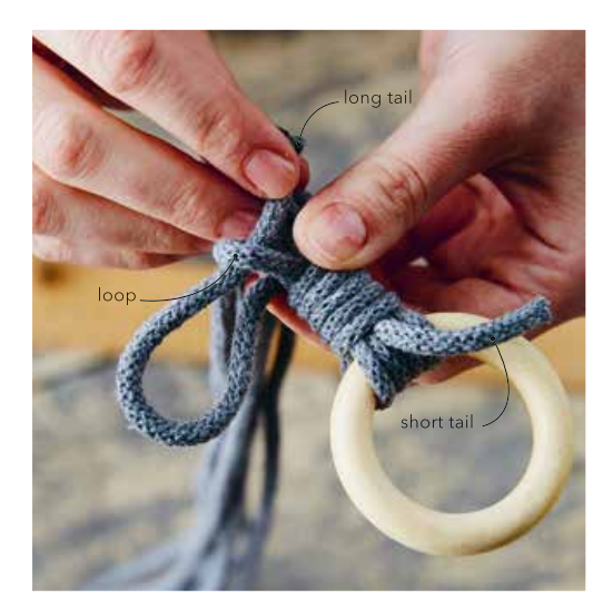
3 Tightly wrap the long tail around the loop and trailing cords 5 times, moving further away from the wooden ring. After 5 turns, thread the remainder of the long tail through the loop hole.