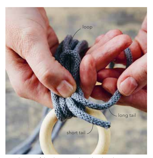
2 Take one of the shorter cords and make a loop at one end. Pinch the loop in place on top of the trailing cords in your right hand, leaving both the long and short tails of the loop above the wooden ring.