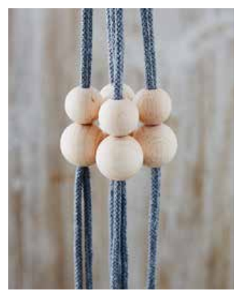
5 Using the S-hook, hang the ring up and check that you have 8 equal lengths of cord hanging down. Separate the cords into 4 pairs. Thread 1 small and 1 large wooden bead onto each pair of cords, approximately 30cm (12in) down from the ring.