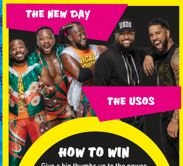
THE NEW DAY