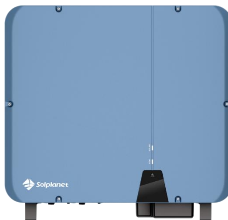
Figure 1. Picture of the ASW 45-60K-LT-G3 Series

The products in this group differ only in active power, but the raw material, manufacturing process, appearance and main function are all the same. Figure 1 shows the picture of this series products.