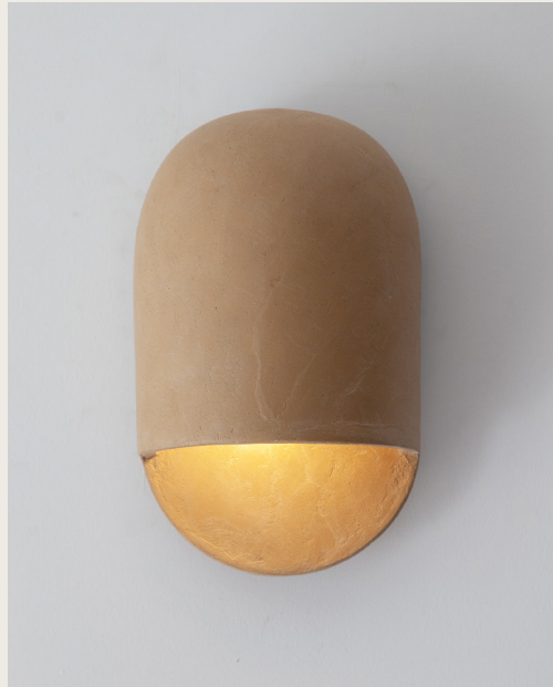
Tera Sconce shown in White Crackle Raku