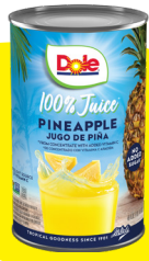
Dole #00808 Pack Size: 12/46 oz