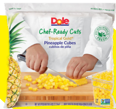
Dole #28317 Pack Size: 2/5lb