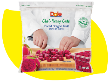
Dole #00330 Pack Size: 2/5lb