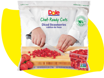
Dole #17591 Pack Size: 2/5lb