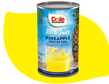
Dole #00808 Pack Size: 12/46 oz