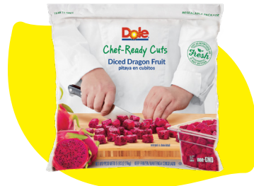
Dole #00330 Pack Size: 2/5lb