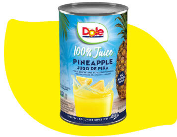
Dole #00808 Pack Size: 12/46 oz