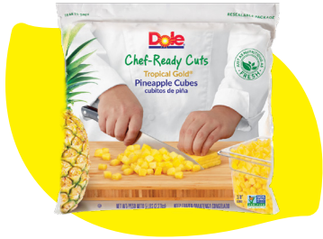
Dole #28317 Pack Size: 2/5lb