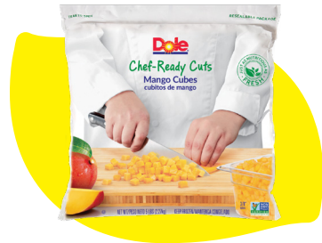
Dole #10550 Pack Size: 2/5lb