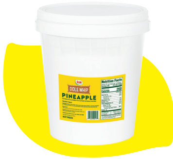
Dole #00417 Pack Size: 1/3 gal