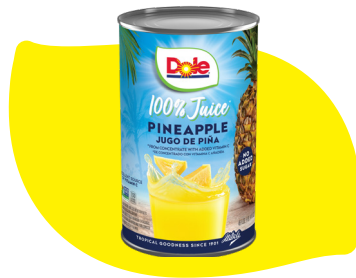
Dole #00808 Pack Size: 12/46 oz