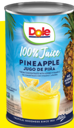
Dole #00808 Pack Size: 12/46 oz