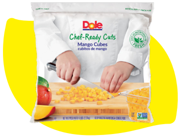
Dole #10550 Pack Size: 2/5lb