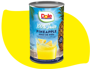
Dole #00808 Pack Size: 6/46 oz