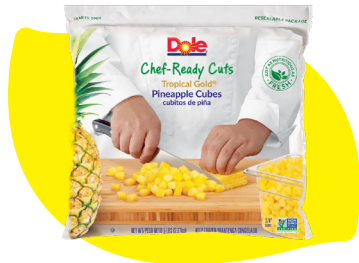
Dole #28317 Pack Size: 2/5lb