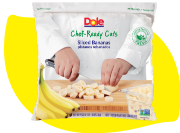
Dole #16118 Pack Size: 2/5lb