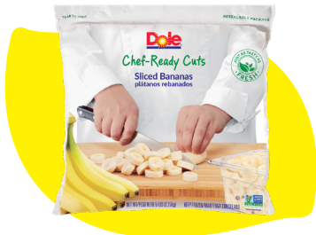
Dole #16118 Pack Size: 2/5lb