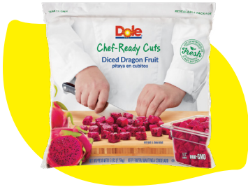
Dole #00330 Pack Size: 2/5lb