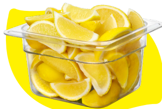
Dole # 00193 Pack Size 1/30 lb