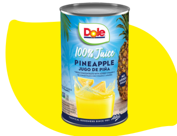
Dole #00808 Pack Size: 12/46 oz