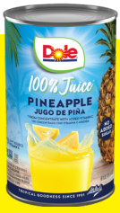
Dole #00808 Pack Size: 12/46 oz