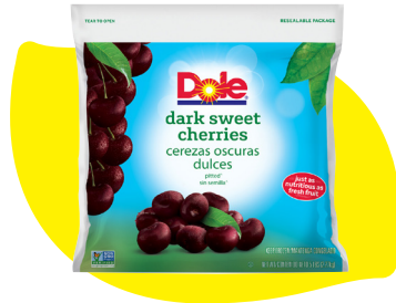
Dole #13711 Pack Size: 2/5lb