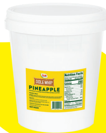
Dole #00417 Pack Size: 1/3 gal