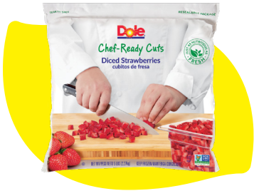
Dole #17951 Pack Size: 2/5lb