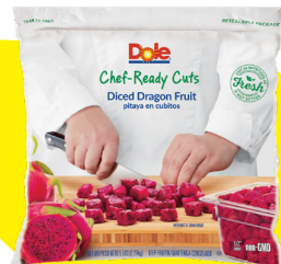
Dole #00330 Pack Size: 2/5lb