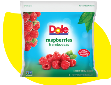
Dole #22711 Pack Size: 2/5lb