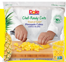
Dole #28317 Pack Size: 2/5lb