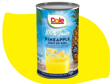
Dole #00808 Pack Size: 12/46 oz