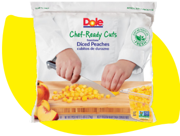
Dole #27600 Pack Size: 2/5lb