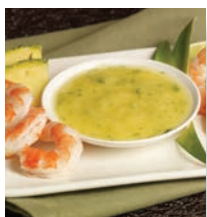
Spiced Pineapple Sauce made with Pineapple Purée