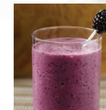
Blackberry Batida made with Blackberry Purée