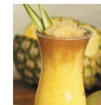
Mango Maple Ginger Daiquiri made with Mango Purée