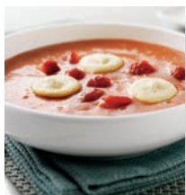
Rhubarb Strawberry Soup made with Strawberry Purée