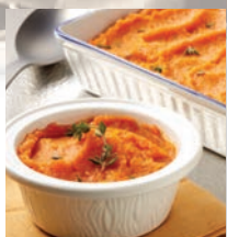
Winter Squash made with Mango Purée