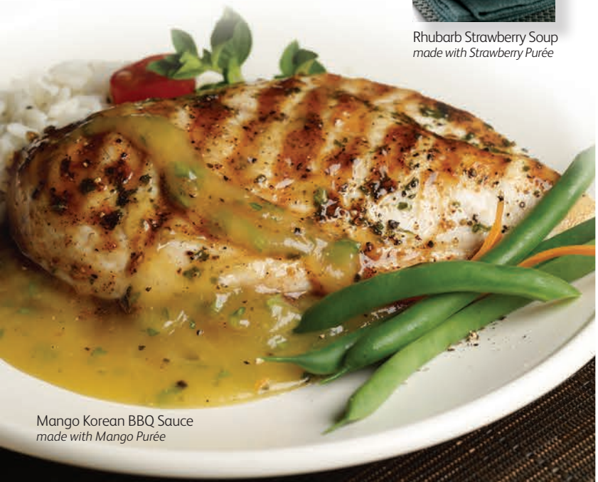
Mango Korean BBQ Sauce made with Mango Purée