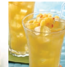
Peach Lemonade made with Peach Purée