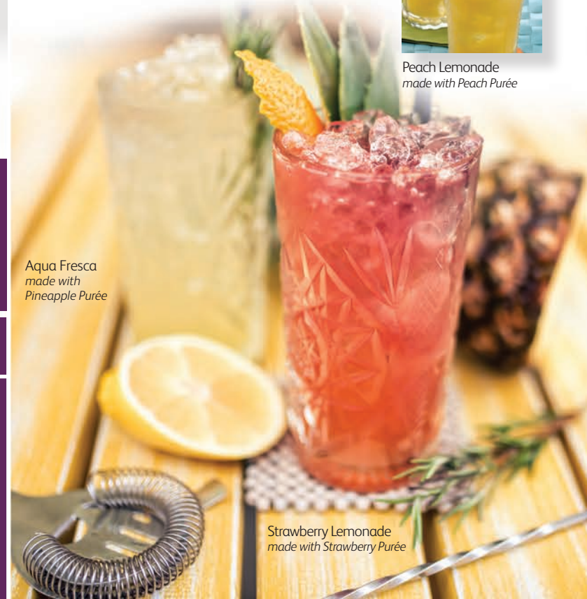
Strawberry Lemonade made with Strawberry Purée