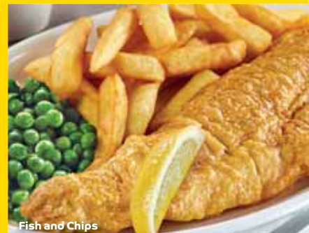
Fish and Chips