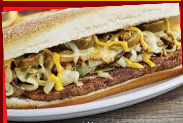
The Ultimate Philly Steak Sandwich