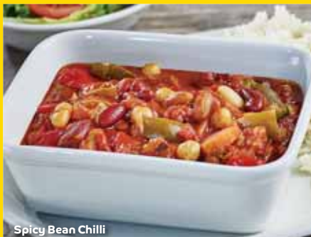
Spicy Bean Chilli