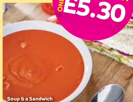
Soup & a Sandwich