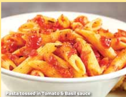
Pasta tossed in Tomato & Basil sauce