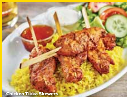
Chicken Tikka Skewers