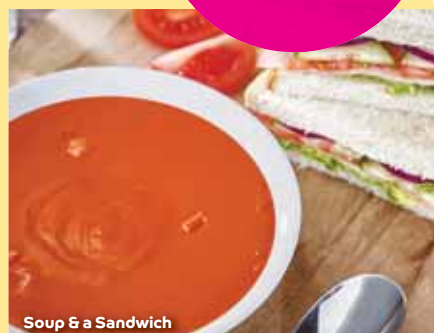
Soup & a Sandwich