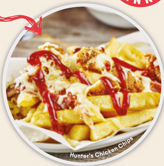
Hunter's Chicken Chips