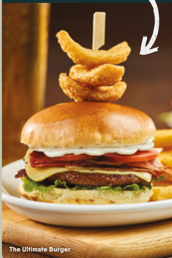
The Ultimate Burger

Topped with cheese, bacon, onion petals, salad and your choice of sauce. Served with a side of chips.