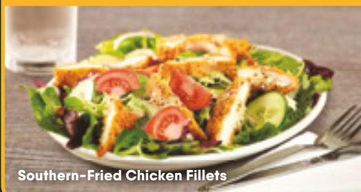
Southern-Fried Chicken Fillets

All salads come on a bed of fresh mixed salad leaves, tomato wedges and cucumber, tossed in your choice of either Caesar or Honey Mustard dressing. Choose from a variety of toppings: