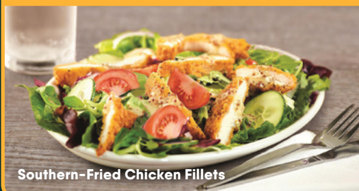
Southern-Fried Chicken Fillets

All salads come on a bed of fresh mixed salad leaves, tomato wedges and cucumber, tossed in your choice of either Caesar or Honey Mustard dressing. Choose from a variety of toppings: