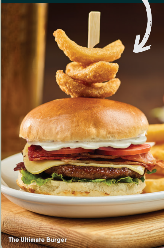
The Ultimate Burger

Topped with cheese, bacon, onion petals, salad and your choice of sauce. Served with a side of chips.