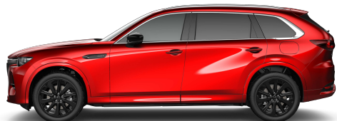
Soul Red Crystal Metallic (46V)