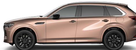
Melting Copper Metallic (52H)