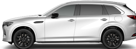
Rhodium White Metallic (51K)