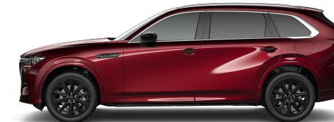
Artisan Red Metallic (51F)