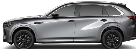
Machine Grey Metallic (46G)