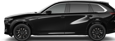
Jet Black Mica (41W)