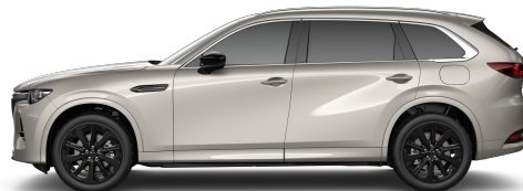
Platinum Quartz Metallic (47S)