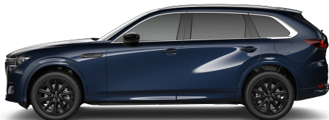
Deep Crystal Blue Mica (42M)