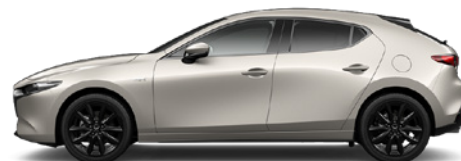
Platinum Quartz Metallic (47S)