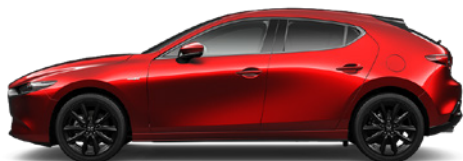
Soul Red Crystal Metallic (46V)