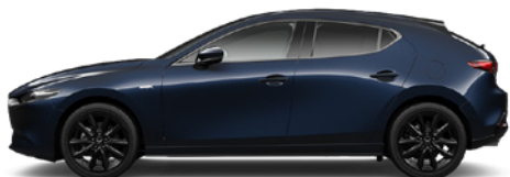
Deep Crystal Blue Mica (42M)