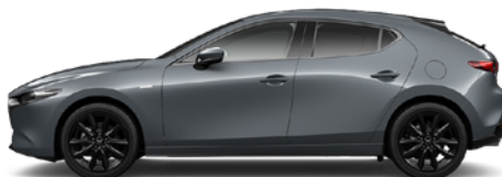
Polymetal Grey Metallic (47C)