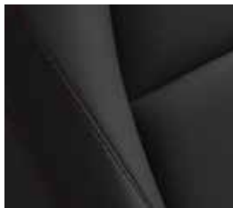
Cloth, Black / Grey with red stitching SP25