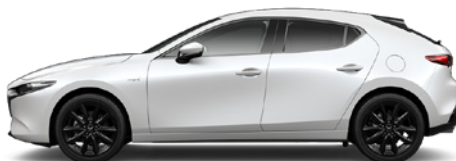
Snowflake White Pearl Mica (25D)