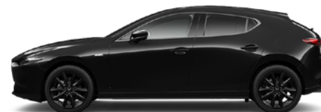
Jet Black Mica (41W)