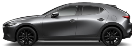
Machine Grey Metallic (46G)