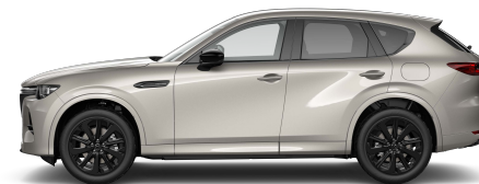
Platinum Quartz Metallic (47S)