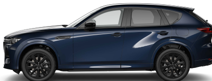
Deep Crystal Blue Mica (42M)