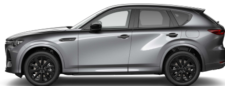
Machine Grey Metallic (46G)