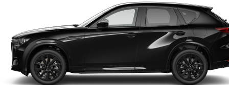
Jet Black Mica (41W)