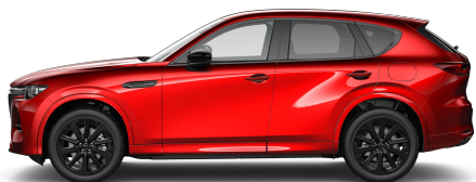
Soul Red Crystal Metallic (46V)