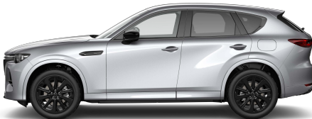
Sonic Silver Metallic (45P)