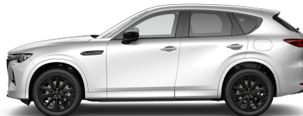
Rhodium White Metallic (51K)