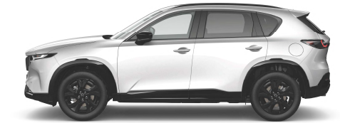
Rhodium White Metallic (51K)