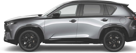
Machine Grey Metallic (46G)