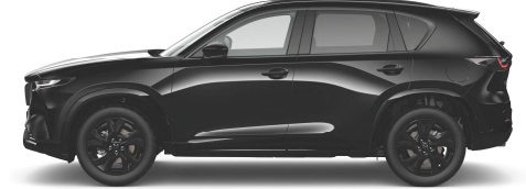
Jet Black Mica (41W)