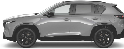
Aero Grey Metallic (52C)