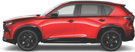
Soul Red Crystal Metallic (46V)