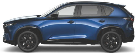
Navy Blue Mica (52M)