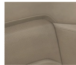
Leather, Sport Tan Takami