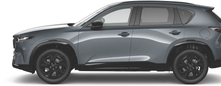
Polymetal Grey Metallic (47C)