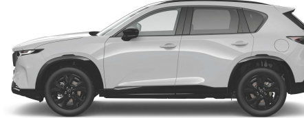
Arctic White (A4D)