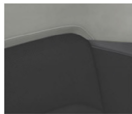
Leatherette with embossed microsuede, Black/Pure White SP (Optional)