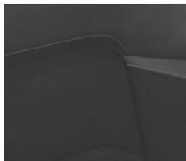
Leatherette with embossed microsuede, Black SP