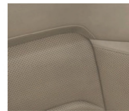
Leather, Sport Tan Takami