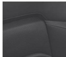
Leather, Black Homura