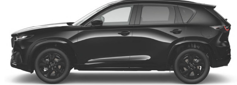
Jet Black Mica (41W)