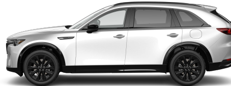
Rhodium White Metallic (51K)