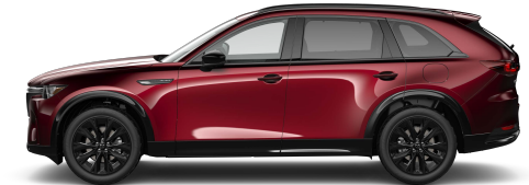
Artisan Red Metallic (51F)