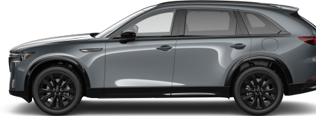
Polymetal Grey Metallic (47C)