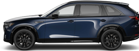
Deep Crystal Blue Mica (42M)