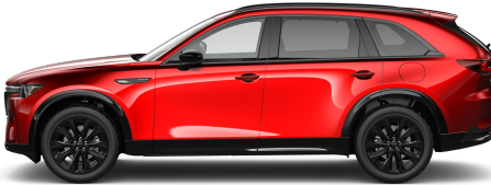
Soul Red Crystal Metallic (46V)