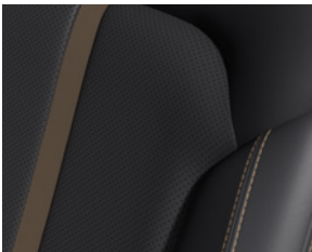
Nappa Leather, Black Takami, Takami Kuro