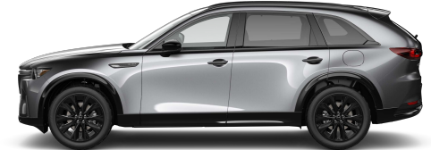
Machine Grey Metallic (46G)