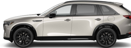
Platinum Quartz Metallic (47S)