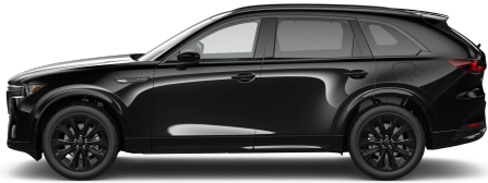
Jet Black Mica (41W)