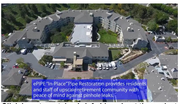
Click here to watch a brief video about the project

Using the ePIPE process,pipes within the 131 unit main building, were repaired "in-place", with minimal disruption to the residents and staff.