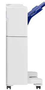
B4 FINISHER 12