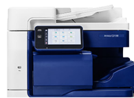
A2 INTERNAL FINISHER