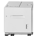
B1 HIGH-CAPACITY FEEDER 2,000 SHEETS