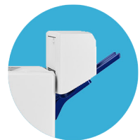
OPTIONAL BOOKLET MAKER FOR B4 FINISHER