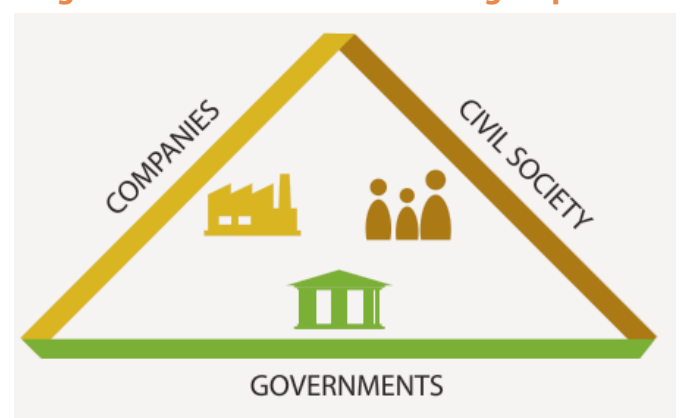
The MSG brings government, company and civil society actors together to act as an EITI board. (Source: EITI 2013)

Government participation in the MSG process has been relatively consistent and high level. When the EITI was first launched in 2012, the Leading Authority was composed of Union Ministers and was chaired by a President's Office Minster. This reflected the Presidential commitment to the EITI process. The creation of the MSG entailed a shift from ministerial engagement toward technocratic engagement with government MSG members drawn primarily from Directors General (DG) of relevant ministries (Finance, Mining, and Energy). Given Myanmar's hierarchical decision-making processes, however, government MSG members still tend to defer any significant decisions upward to their Ministers before acting. 16