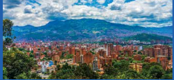
MEDELLIN, COLOMBIA

What were the political processes behind the 'Medellín Miracle'? Violence in Colombia's most industrialised city dropped by more than 90% from its peak in 1991 of over 380 murders per 100,000 people. To investigate this