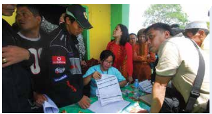
VOTER RE-REGISTRATION IN THE PHILIPPINES

Secondary and tertiary education can play a vital role in creating developmental leadership.