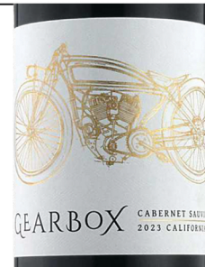
GEARBOX CABERNET SAUVIGNON (2023)