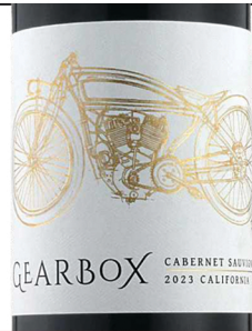
GEARBOX CABERNET SAUVIGNON (2023)