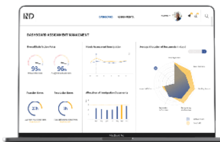
Front & Back End: ICU Next DESTINATION