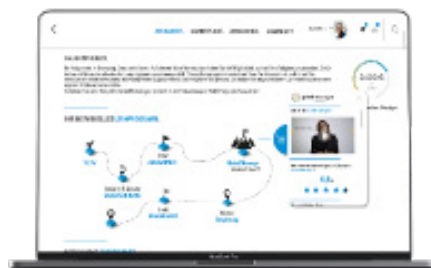
Front End Desktop: Micro Marketplace