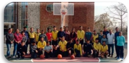
Raphael's students at The Oasis School

Raphael celebrated its 64 th Founders' Day with much enthusiasm and we were delighted to have an audience of nearly 700 people which included parents, students from regular schools and local friends of Raphael. The theme of the cultural