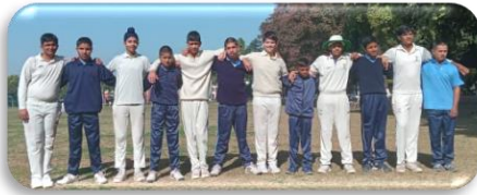
Friendly Cricket Match at The Doon School

Some of our students took part in 'Friendly' matches with two mainstream private residential schools. The Doon School invited our team to play cricket and were astounded by the skills our students showed. Similarly, another team played Basketball with the OASIS School and left the host school quite impressed. We are grateful for the opportunities we received but equally important, it is essential for the students of other schools to change their perceptions on disability.