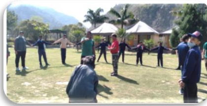
Students participating in activities of IAYP Camp

International Award for Young People: (IAYP) Twenty-three students completed the residential project and adventure journey on 27–29 March at Maldevta.