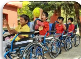
Items donated by Garware Fulflex Social Foundation