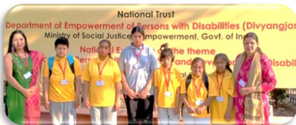
Participants of Dance Competition at New Delhi

Three families, from Bageshwar, Nainital and Meerut, attended the week-long Intensive Training Residential Programme with their children. The parents are given an individual detailed home based programmes for their children which includes various activities, videos for domestic activities and speech and sensory activities.