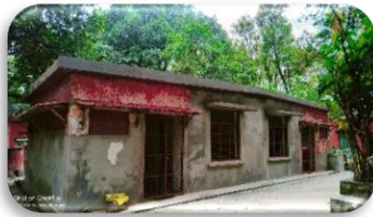
Renovation at Shiv Sadan

DONORS: We are always indebted and thankful to our donors for their contributions: