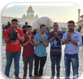
Residents at Golden Temple

4 young males with borderline disability are being trained as helpers and are currently receiving a small stipend. Accompanied by 2 special educators, they were taken on a 3-day outing to Amritsar where they then visited the Golden Temple, Jallianwala Bagh, and Atari- Wagah Border. They also enjoyed the different food which was a novelty for them.