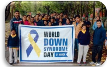
An Awareness Walk by Raphael's students

The theme for Down Syndrome Day observed on 21 st March this year was “With Us Not for Us.” The students, residents and the staff of Raphael dressed in yellow and blue participated in a walk to raise awareness about Down Syndrome. The hostel buildings were also lit up in yellow and blue.