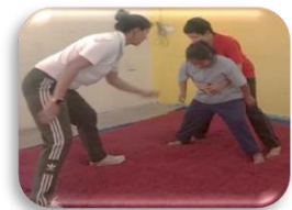
Self defence techniques