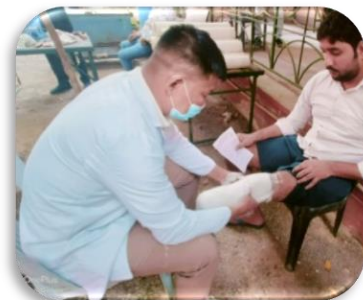
A beneficiary of Artificial Limb Camp

A two days Artificial Limb Camp was organized in collaboration with Shree Bhagwan Mahavir Viklang Shayata Sansthan Samiti on 16th and 17th March. This camp was sponsored by Bajaj Finserv Ltd. A total of 163 appliances were distributed. There were 94 beneficiaries of whom 60 were children and they came from Uttarakhand and UP.