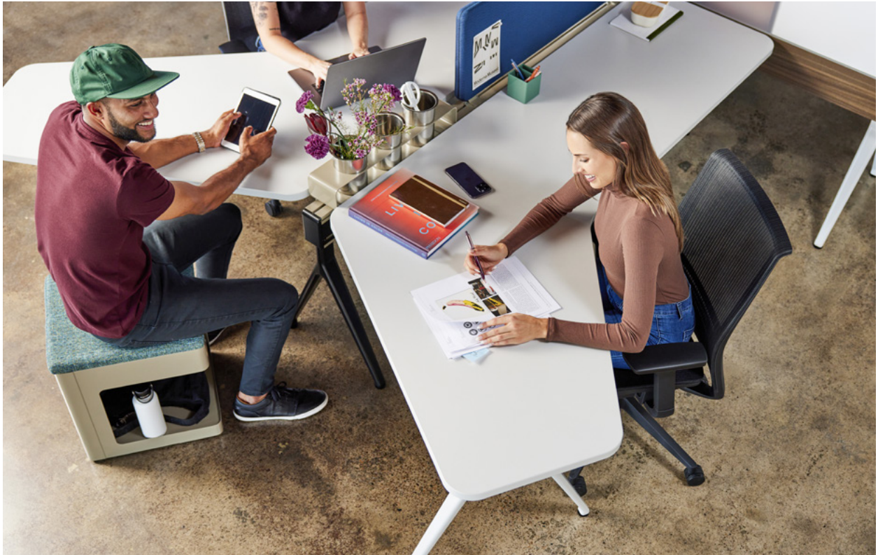
products shown EverySpace® by Kimball Joya® by Kimball