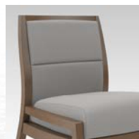
FULLY UPHOLSTERED BACK