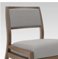
HALF UPHOLSTERED BACK