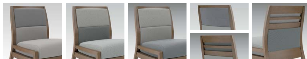
CONTRASTING FABRIC BACK

Acquaint's flexibility is evident in its back options and contrasting fabric locations. Choose the back style that best fits your space and highlight your selection by adding contrasting fabrics. The curved back adds lumbar support while creating a wall saver design to protect your walls. Maximize comfort by adding optional protective arm caps. The elevated, non-slip footrest provides support for guests as they get into and out of the easy access chair. Transform standard upholstery options by adding Stitch-it™ to create a quilted aesthetic.