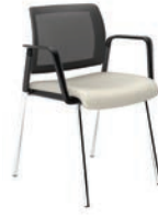
STATIC GUEST AVAILABLE IN MESH + UPHOLSTERED BACK, ARMLESS + ARMS