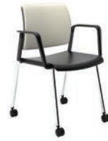
MOBILE GUEST AVAILABLE IN MESH + UPHOLSTERED BACK, ARMLESS + ARMS