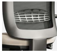
ALL MESH BACK TASK MODELS FEATURE AN ADJUSTABLE LUMBAR