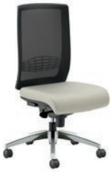
TASK ARMLESS AVAILABLE IN MESH + UPHOLSTERED BACK