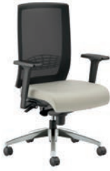
TASK ARMS AVAILABLE IN MESH + UPHOLSTERED BACK