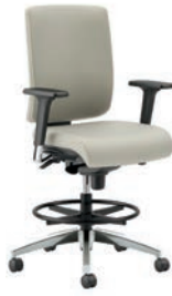
TASK STOOL AVAILABLE IN UPHOLSTERED BACK, ARMLESS, TASK, + CONFERENCE ARMS