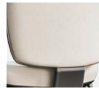
ALL UPHOLSTERED BACK TASK MODELS FEATURE A HEIGHT ADJUSTABLE BACK