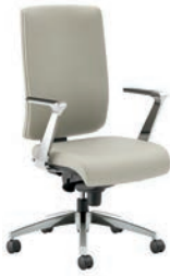
TASK CONFERENCE AVAILABLE IN MID + HIGH BACK UPHOLSTERED