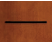
BEAM 423, 462, 463, 501, 503