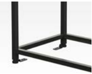
SECURE TO FLOOR