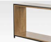
PASS THROUGH BOX