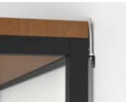
SECURE TO WALL