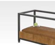
PET BED CUSHION