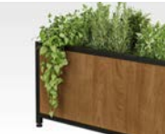
OPEN TOP BOX