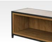
OPEN FRONT BOX