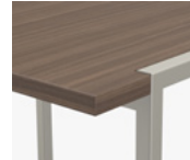
LAMINATE OR VENEER