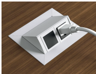
g17 silver or black