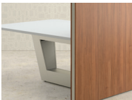
satin nickel metallic