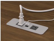
g23 silver or black