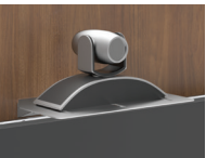
camera shelf designer white, platinum metallic, satin nickel metallic, or cinder