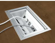
power/data oasis silver or black