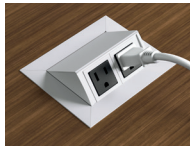
g172 silver or black