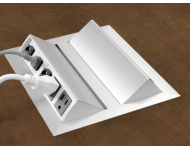
double pivoting power grommet silver or black