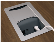
marina™ hdm i collaborative meeting technol ogy silver or black