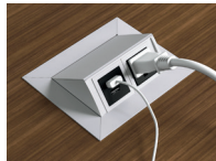
g173 silver or black