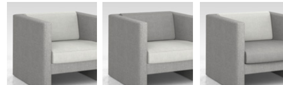
CONTRASTING FRAME UPHOLSTERY