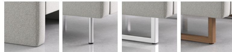
UPHOLSTERY ALL FABRIC OPTIONS