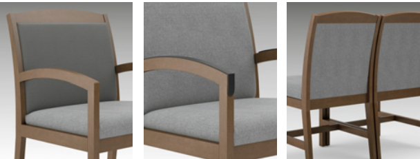
CONTRASTING FABRIC OPTIONAL PROTECTIVE ARM CAPS GANGING

Timberlane offers a variety of styles, each with their own purpose. In addition to various back designs, tandem options, and bariatric models, Timberlane offers accents to create the exact look you desire. Add contrasting fabric to achieve intriguing visual displays. Optional protective arm caps add durability for high-use areas. When ganging is needed, Timberlane offers solutions to keep seats aligned and connected. Accommodate any space with Timberlane's allure and versatility.