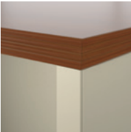
REED PVC SELECT WOODGRAIN LAMINATES