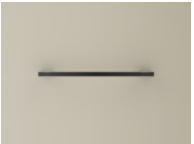
BEAM PULLS CINDER (462) PLATINUM METALLIC (501) SATIN NICKEL METALLIC (503)