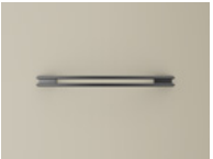
MALIBU PULLS CINDER (462) PLATINUM METALLIC (501) SATIN NICKEL METALLIC (503)