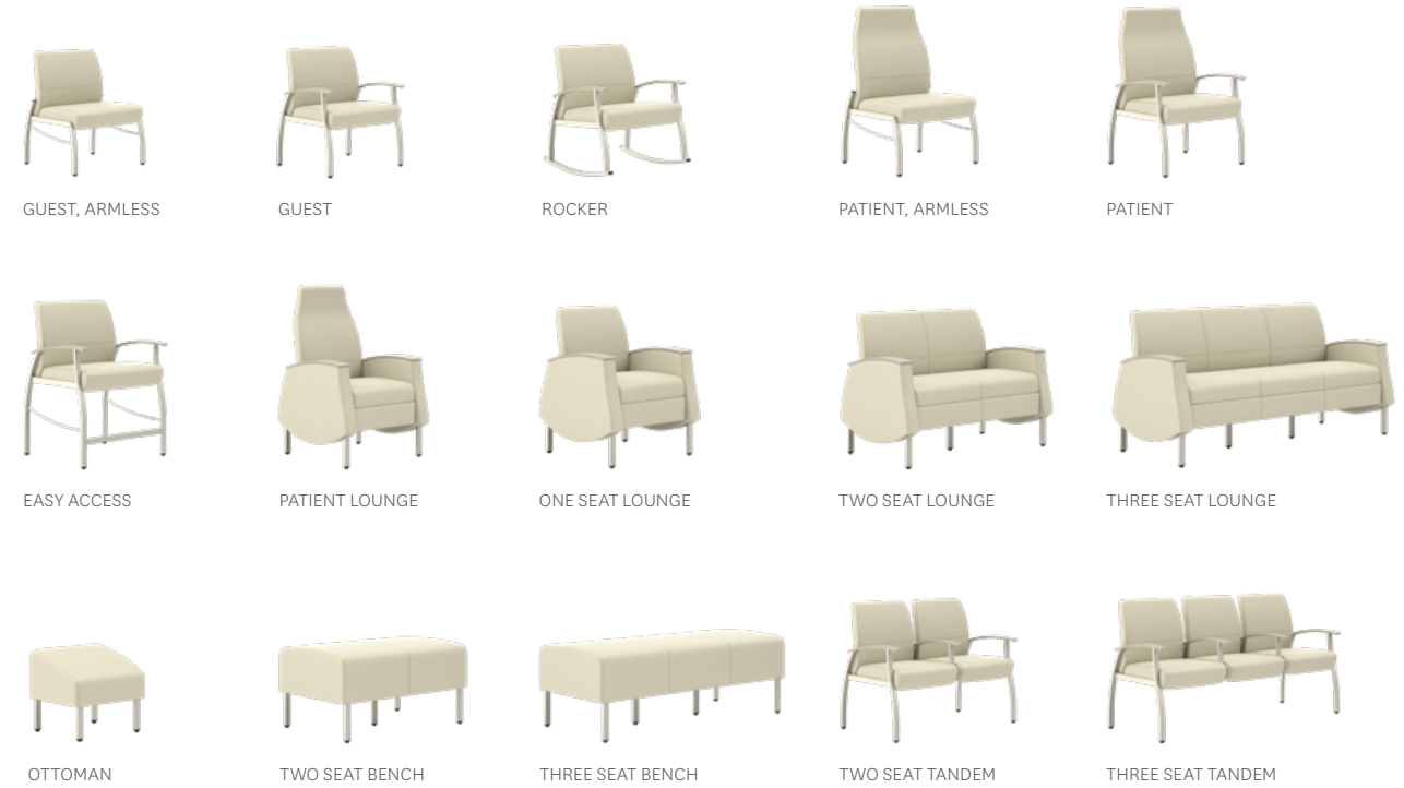
GUEST, ARMLESS GUEST ROCKER PATIENT, ARMLESS PATIENT EASY ACCESS PATIENT LOUNGE ONE SEAT LOUNGE TWO SEAT LOUNGE THREE SEAT LOUNGE OTTOMAN TWO SEAT BENCH THREE SEAT BENCH TWO SEAT TANDEM THREE SEAT TANDEM