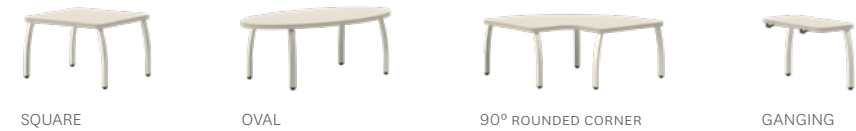
SQUARE OVAL 90° ROUNDED CORNER GANGING