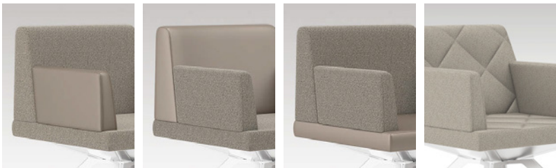
CONTRASTING ARMS CONTRASTING BACK CONTRASTING SEAT STITCH-IT™

With a silhouette that's the epitome of flowing form and clean lines, Farrah's angles create dramatic elegance. Precise craftsmanship partnered with smooth upholstery, offers complete comfort with an uncompromising presence. Add even more drama to Farrah by selecting contrasting fabrics or adding Stitch-it™ to create a quilted aesthetic of intricate or simple stitched designs. Choose from static or swivel base to accommodate the precise functionality your space requires. Highlight Farrah's tapered legs by choosing a finish to complement or distinguish your style.