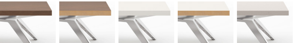
VENEER TOP FLAT RIM VENEER TOP EXPOSED PLYWOOD RIM LAMINATE TOP FLAT RIM LAMINATE TOP EXPOSED PLYWOOD RIM CORIAN® TOP

As an elegant companion to Farrah seating, or as a stand-alone table in an open space, exude beauty and spark conversations with Farrah tables. Farrah's sleek shape and modern profile are highlighted by veneer, laminate, or Corian top options. Select a flat rim detail or add the unexpected by choosing an exposed plywood rim. It's hard to debate whether the rim profile or legs are the most stunning detail of these tables. Either way, Farrah tables command attention.