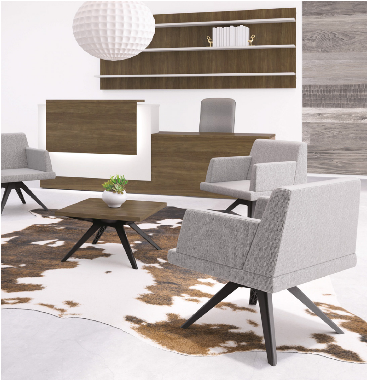
FARRAH® LOUNGE N71M1MV, ARC-COM PROVENCE MIST AND STINSON MODENA GRIGIO WITH STITCH-IT™, 3" SINGLE STITCH DIAMOND GRID, SATIN NICKEL METALLIC FARRAH® BENCH N71D2, STINSON MODENA GRIGIO, SATIN NICKEL METALLIC FARRAH® TABLE N71T2552MGDLW, SABLE LAMINATE, SATIN NICKEL METALLIC WAVEWORKS® CASEGOODS SABLE LAMINATE STRASSA™ TABLE SABLE LAMINATE JEWEL™ STOOLS WHITE FINISH