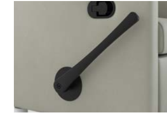
Footrest Release Lever