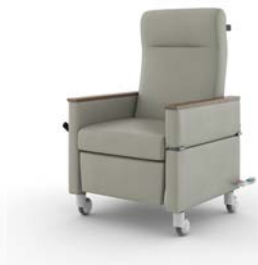
Central Locking with Drop Arm