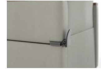
Drop Arm Release Lever