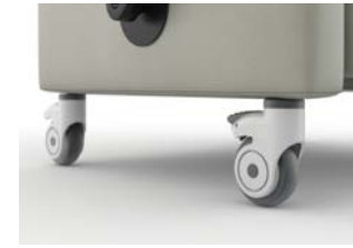
Individual Locking Caster