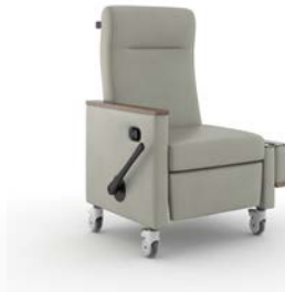
Individual Locking with Drop Arm