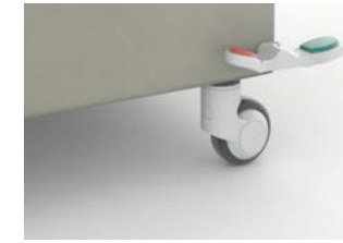
Central Locking Caster Paddle