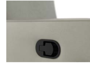
Back Release Lever