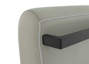
Bump Guard (protective welt cord)