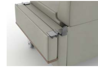
Drop Arm Released