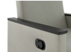
Polyurethane Arm Cap