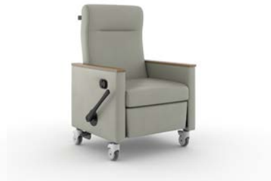
Individual Locking with Trendelenburg