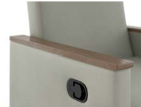
Wood Arm Cap