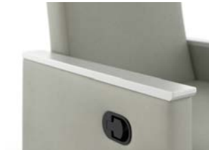
Solid Surface Arm Cap