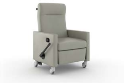
Central Locking with Trendelenburg