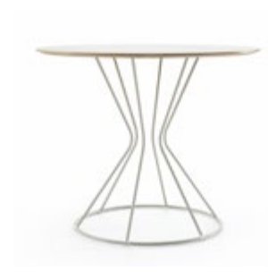
36" W, 28" H Also available in 30" W. Shown in Laminate