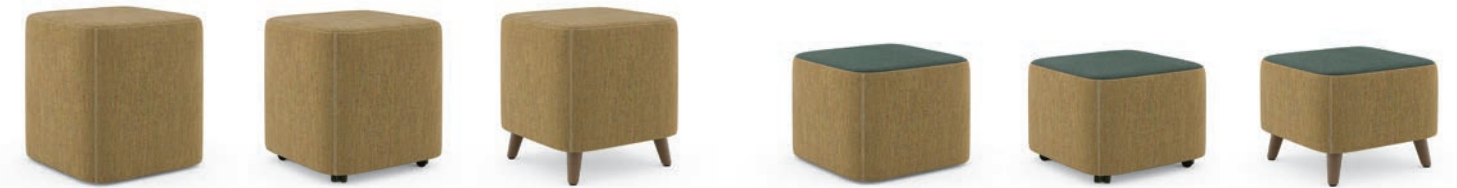
18" H, 18"D Glides 18" H, 18"D Casters 18" H, 18"D Wood Legs 13" H, 18"D Glides 13" H, 18"D Casters 13" H, 18"D Wood Legs