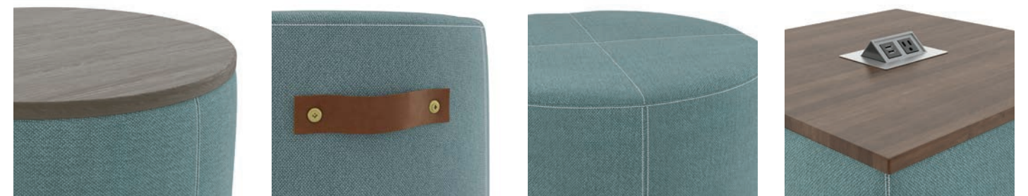
Ottoman Surface Leather Strap Stitching Detail Power Wood, Butcher Block, TFL, HPL Ebony, Chestnut, Camel Available in 24" Modular Ottoman Surface and Lounge Seating