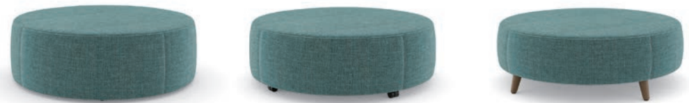
13" H, 40"D Glides 13" H, 40"D Casters 13" H, 40"D Wood Legs