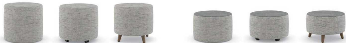
18" H, 20"D Glides 18" H, 20"D Casters 18" H, 20"D Wood Legs 13" H, 20"D Glides 13" H, 20"D Casters 13" H, 20"D Wood Legs