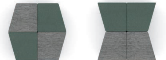
18"D Trapezoid Configuration 18"D Trapezoid Configuration

Ottoman Surface not available on Trapezoid Ottomans.