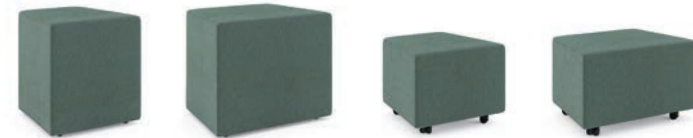
18" H, 18"D Glides 18" H, 23"D Glides 13" H, 18"D Casters 13" H, 23"D Casters