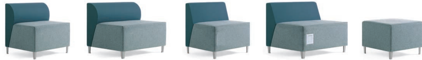
30° Rounded Back 51° Rounded Back 30° Angled Back 51° Angled Back with Power 24° Modular Ottoman

Rounded Back and Angled Back available in 24", 30", 36", 48" and 51" widths