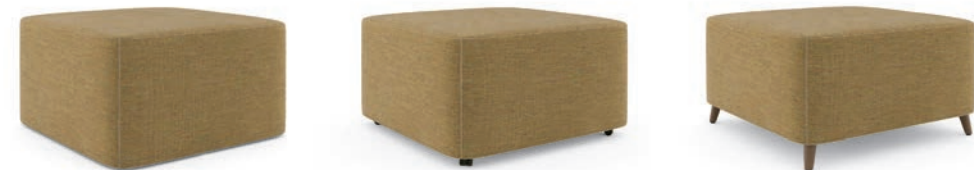
18" H, 36"D Glides 18" H, 36"D Casters 18" H, 36"D Wood Legs