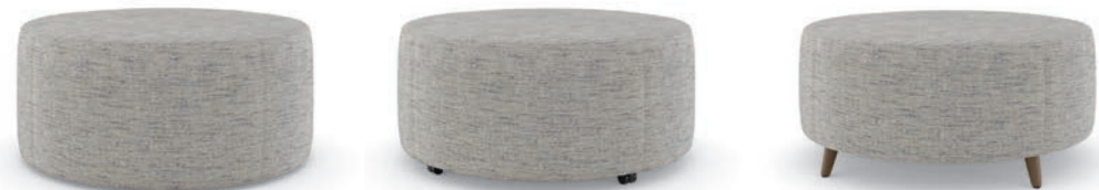
18" H, 40"D Glides 18" H, 40"D Casters 18" H, 40"D Wood Legs