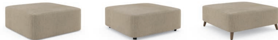
13" H, 36"D Glides 13" H, 36"D Casters 13" H, 36"D Wood Legs