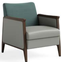
Optional Contrasting Fabric *Multiple combinations