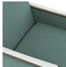
Clean-Out Optional Arm Caps