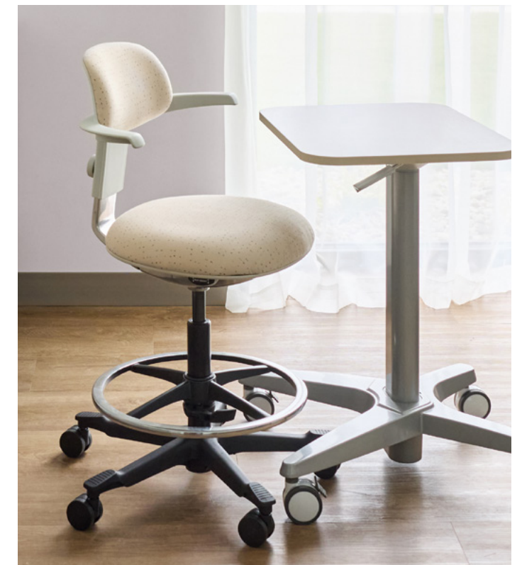
Also shown Table: Aidin ®

Rolli is thoughtfully designed to provide maximum comfort and functionality for a wide range of tasks across workplace, learning, and healing environments. From collaborative areas and classrooms to nurses' stations and exam rooms, Rolli's versatility supports diverse needs, enabling employees, educators, and caregivers to perform at their highest level.