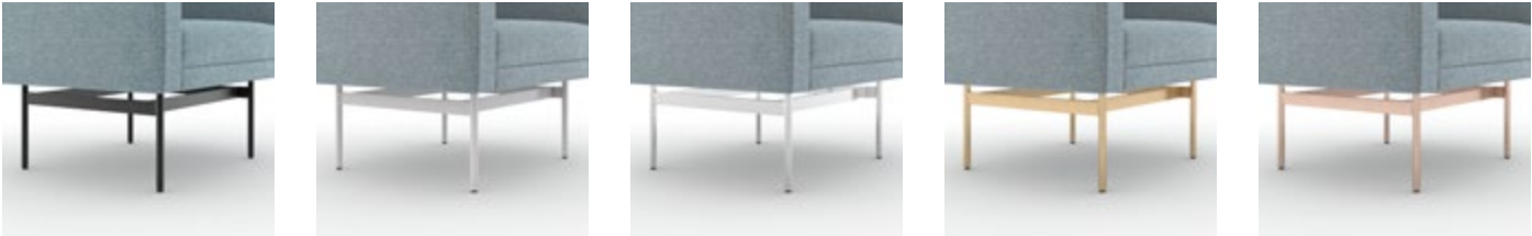
Cinder Designer White Chrome Gold Rose Gold