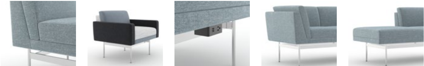
Clean-out Contrasting Fabric Power/USB Corners Peninsulas