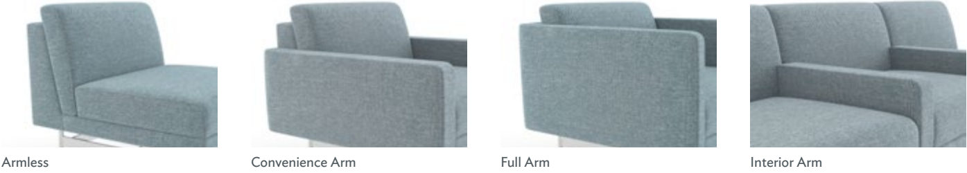
Armless Convenience Arm Full Arm Interior Arm