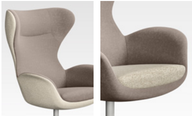
FRONT/EXTREME BACK SEAT CUSHION