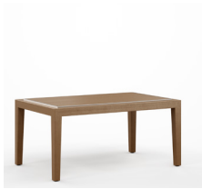
Large Rectangle Coffee Table