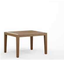
Small Rectangle Coffee Table