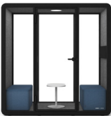
KOLO 2 (87W x 47.25"D x 89"H)