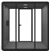
KOLO 4 & 6 (87"W x 135"D x 89"H) (87"W x 91.75"D x 89"H)

KOLO 1, 1 PLUS, 2, 4, and 6 are available in: