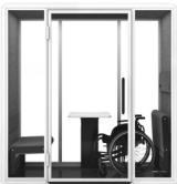
KOLO 2 ADA (86.75"W x 50.5"D x 87.75"H)