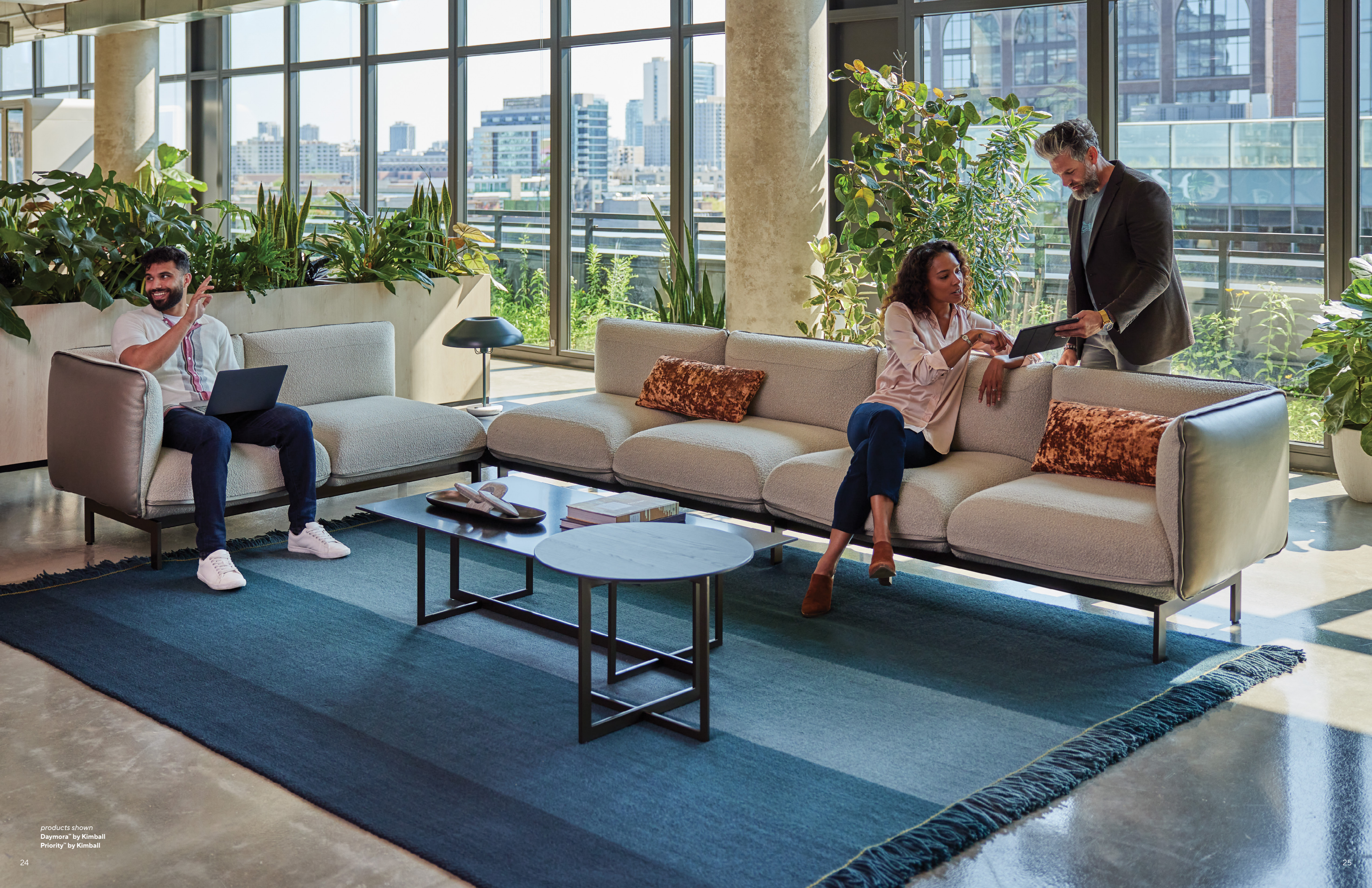
products shown Daymora™ by Kimball Priority™ by Kimball