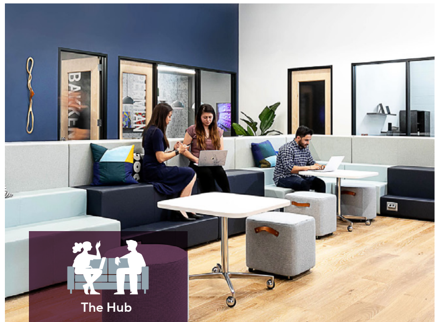
PRODUCTS SHOWN Nash™ Stools / Pairings® Lounge / Joelle™ Ottomans / Joya™ Task Seating Kore® Table and Mobile Cart

Recognizing the importance of defining their brand and culture, Ambynt incorporated welcoming Culture Café spaces to cultivate social connections and idea sharing. A vibrant town hall gathering area, representing a Hub space that fosters a shared sense of purpose and cohesiveness among employees, was achieved through the use of Pairings, Dock, and Nash stools.