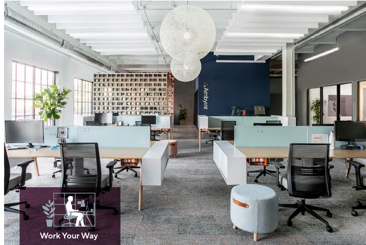
PRODUCTS SHOWN Kore® Workstations / Joya™ Task Seating / Joelle™ Ottomans

In line with their culture of continuous inquiry and dynamic collaboration and to help attract new clients and investors, Ambynt integrated a variety of tech-savvy Meet-Up spaces to enable physical and virtual interaction. In the formal meeting room, Theo conference chairs were chosen to provide comfort and mobility during important discussions. Narrate shelters were used to create two multipurpose meeting spaces in the open plan, featuring Theo chairs and Joelle ottomans to provide comfort and inspire creativity.