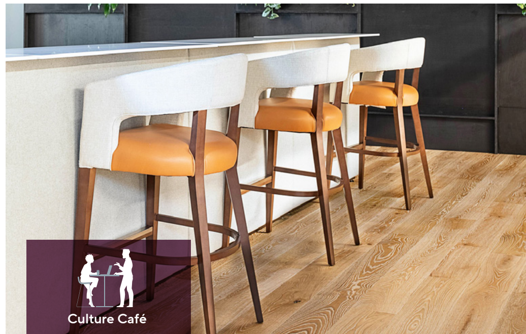
PRODUCTS SHOWN Nash™ Stools / Pairings® Lounge / Joelle™ Ottomans / Joya™ Task Seating Kore® Table and Mobile Cart