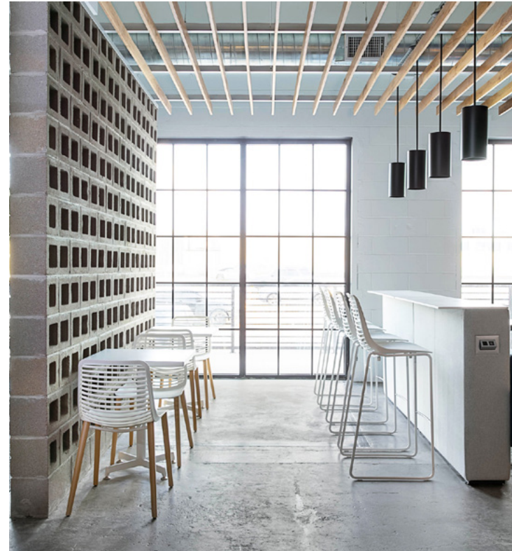
PRODUCTS SHOWN Nash™ Stools / Pairings® Lounge / Joelle™ Ottomans / Joya™ Task Seating Kore® Table and Mobile Cart