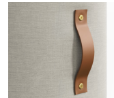
LEATHER HANDLE, CAMEL