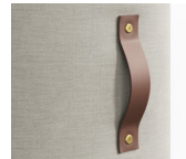
LEATHER HANDLE, CHESTNUT