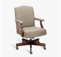
Independence™ Suffolk Kimball

Also available: Guest and multipurpose seating