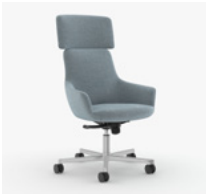
Aspen™ DAVID EDWARD

Also available: Lounge and guest seating