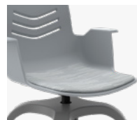
UPHOLSTERED SEAT PAD