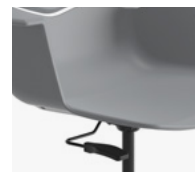
PNEUMATIC HEIGHT ADJUST