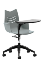
TASK CHAIR, TABLET ARM