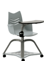
STUDENT CHAIR, TABLET ARM